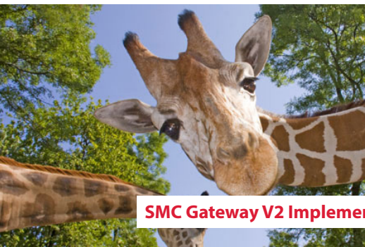
SMC Gateway V2 Implementation at Marvell Zoo

The Track application provided the ability to see where the radio users are at any given time from any device with a web browser, enabling users to identify the closest person for a particular task. Marwell used the flexible tools in the Gateway to build a messaging application for PC users to send text messages to radio which integrated seamlessly into their Microsoft Active Directory.