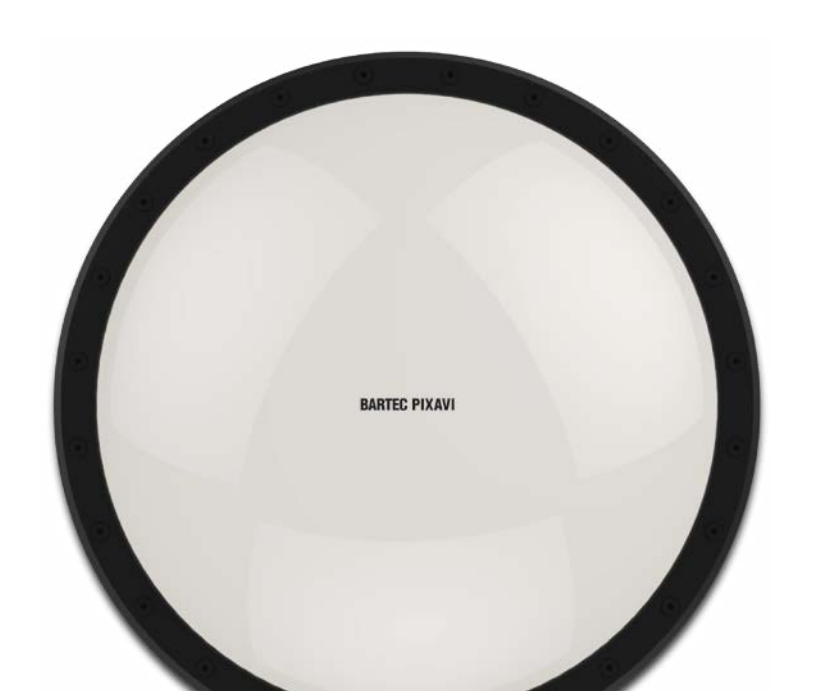
« No more 50 kg steel enclosures. This is a revolution! »